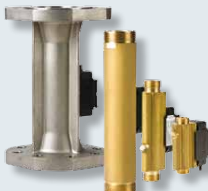
Flow sensors ULTRAFLOW® 54 q_p 0.6 to 40 m^3/h