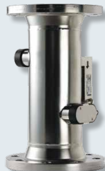
Flow sensors ULTRAFLOW® q_p 60 to 1,000 m^3/h